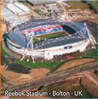
Reebok Stadium - Bolton - UK