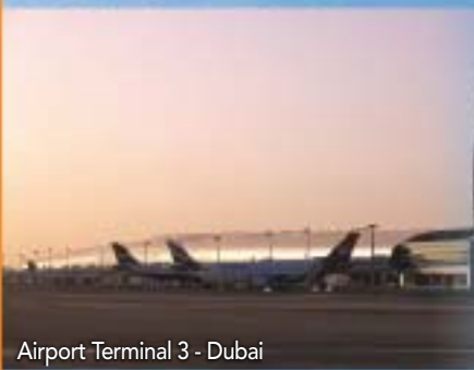
Airport Terminal 3 - Dubai