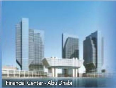
Financial Center - Abu Dhabi