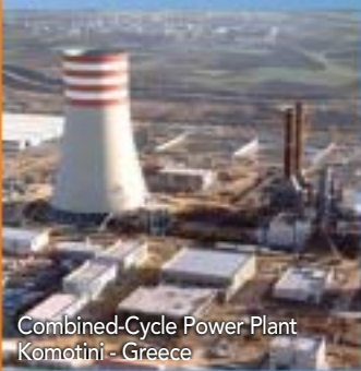
Combined-Cycle Power Plant Komotini - Greece

FIRECEL cables are installed all over the world. New projects are coming. Cavicel has been committed since 1970 to the study, design and manufacture of highly reliable fire resistant cables. Designed and manufactured in Italy.