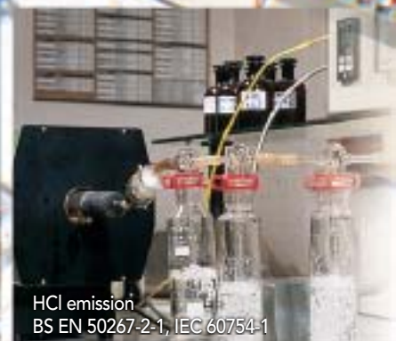
HCl emission BS EN 50267-2-1, IEC 60754-1