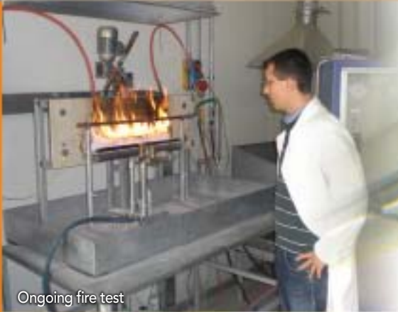
Ongoing fire test

FIRECEL cables are tested and certified by a third part laboratory. Anyway in Caviced all tests related to fire are inhouse performed on a regular base, to get a very high trust to assure Customers the complete safety.