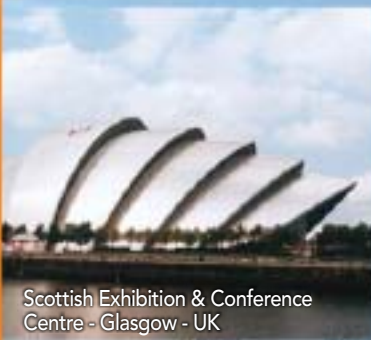
Scottish Exhibition & Conference Centre - Glasgow - UK