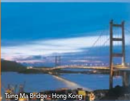
Tsing Ma Bridge - Hong Kong