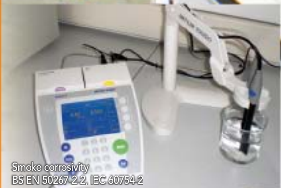
Smoke corrosivity BS EN 50267-2-2, IEC 60754-2