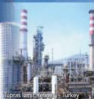
Tupras Izmir Refinery - Turkey