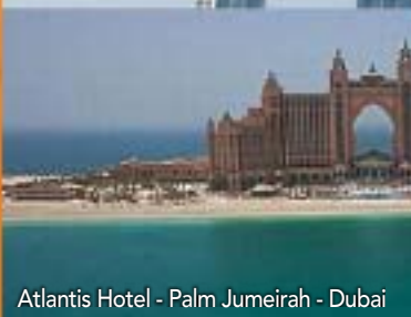
Atlantis Hotel - Palm Jumeirah - Dubai