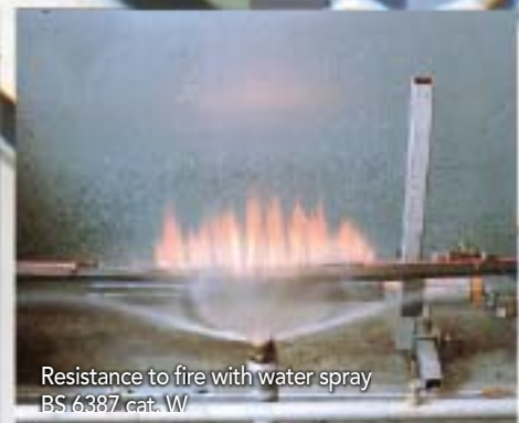
Resistance to fire with water spray BS 6387 cat. W