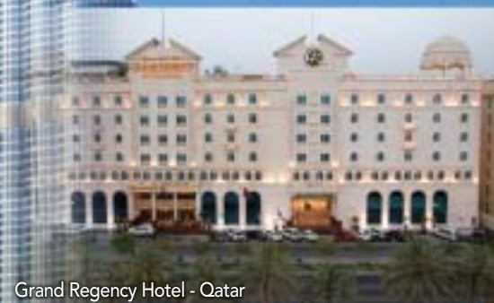
Grand Regency Hotel - Qatar