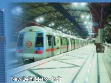
New Delhi Metro - India