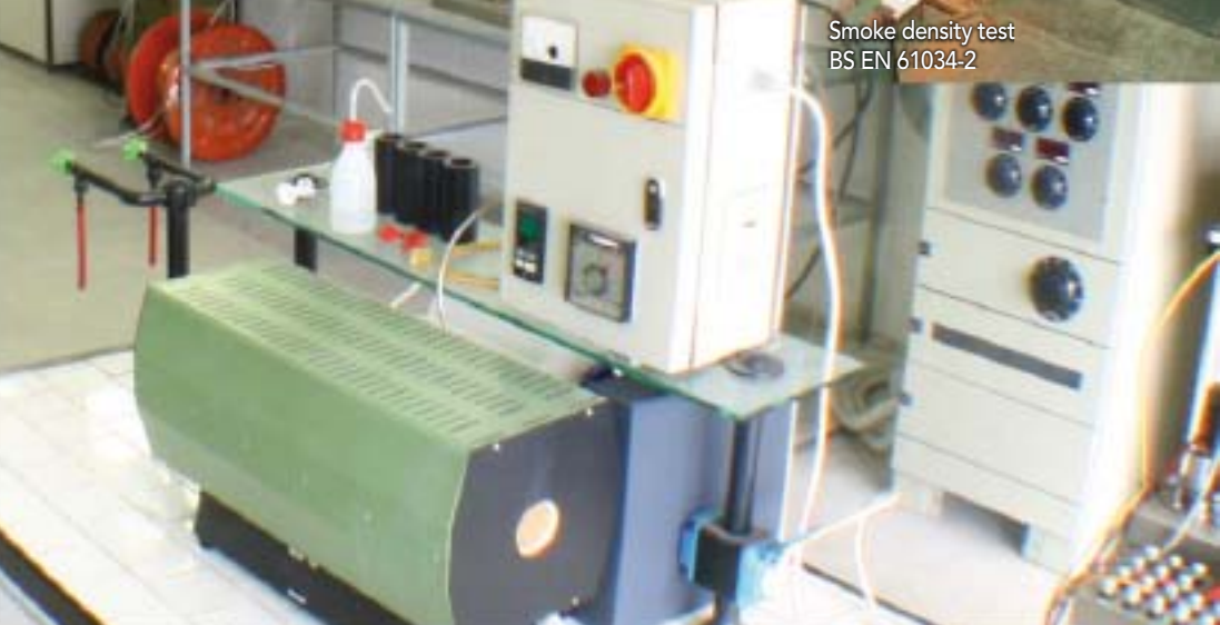
Smoke density test BS EN 61034-2