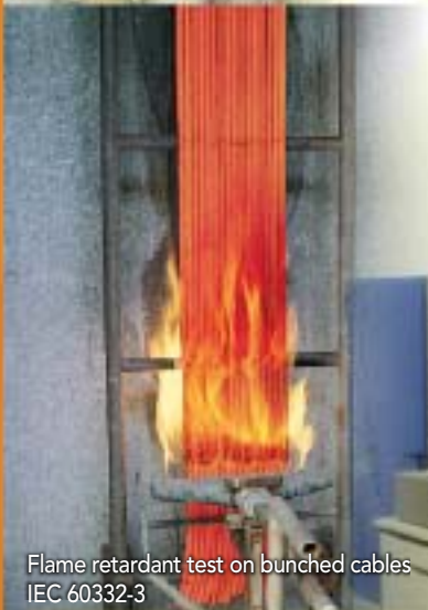
Flame retardant test on bunched cables IEC 60332-3