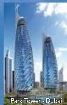
Park Tower - Dubai