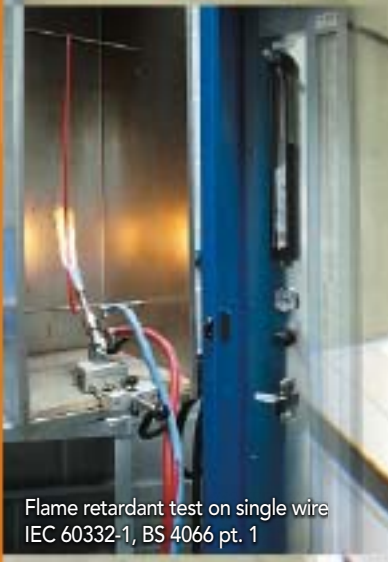
Flame retardant test on single wire IEC 60332-1, BS 4066 pt. 1