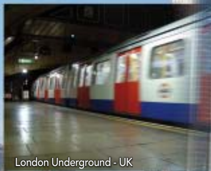
London Underground - UK