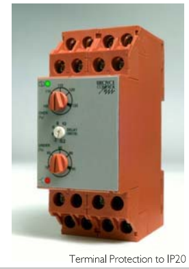
Terminal Protection to IP20